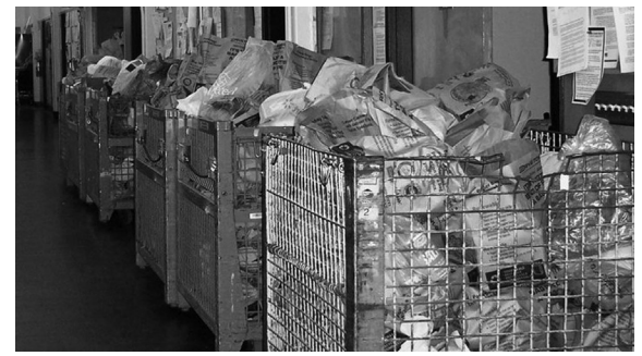
Bins of food lined up in local post office waiting to be picked up by the Food Bank.

How do those in need receive the food donation I make to the Food Bank? Your food donation is either picked up by one of our trucks or you deliver it to our location at 375 Industry Drive in Auburn. It is then sorted, weighed, inspected, and distributed to the Food Bank's partner hunger relief agencies across our service area.